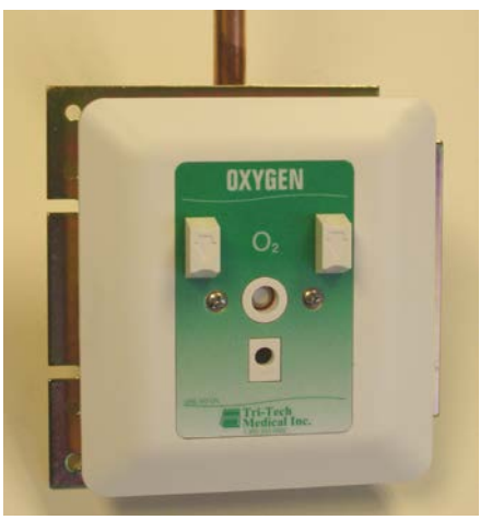
Part Number XA1124 Shown

The outlet nameplate shall be permanently color coded with a durable, scratch resistant and protective label. The outlet trim plate shall be die cast aluminum, powder coated white, attached with the nameplate to the rough-in assembly, and provide automatic plaster adjustment from 1/2 to 1 1/4 of an inch (1.3 cm to 3 cm).